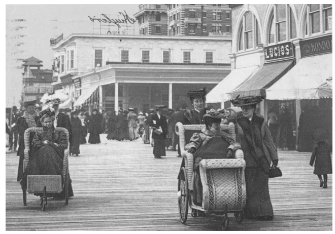
The Boardwalk Atlantic City NJ, rolling chairs visible; after 1898; Detroit Publishing Company