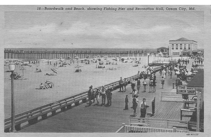
Vintage postcard from Ocean City, Maryland; c.1953

fixtures of the boardwalk have come and gone, including a lighthouse, various piers, amusements, casinos, museums and many other businesses. The Atlantic City Boardwalk has also evolved in size and shape, and now stretches over 4 miles long, is 60 feet wise at its widest areas, and is 12 feet above sea level at the highest point. It remains worth a visit for anyone seeking an American destination bursting with history, recreation, delightful nostalgia, and memorable entertainment.